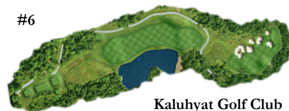
Kaluyhat Golf Club

Designer Robert Trent Jones, Jr. has established both a links feel with wide open fairways, and the need for strategy with narrow tree-lined holes. The course features six lakes, spectacular views and dramatic elevation changes. Kaluyhat is consistently rated by golf critics and magazines as one of the top new courses in the US.